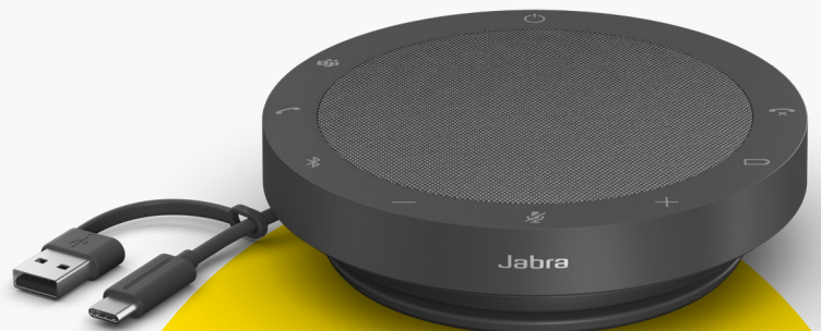
MS TEAMS & UC VARIANTS

We consider sustainability carefully at every stage of product development. The casing of Speak2 55 is made with over 50% sustainable materials**, and has a number of built-in parts that can be repaired or replaced. Better sustainability = longer speaker life = great calls for you and your team for years to come.