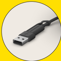
USB C and USB A connectors included